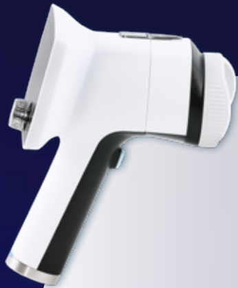
Eye surface imaging