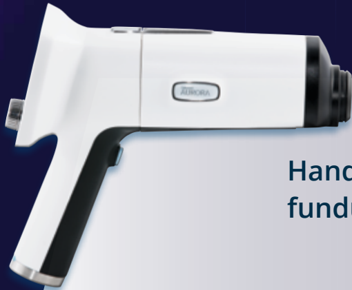
Handheld fundus camera