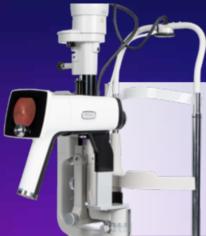
Can be mounted to a slit lamp